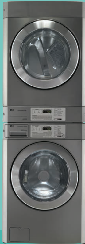
GCWP1069LD2 – OPL Washer, Lower Stack GD1329LGW2 – OPL Dryer (gas), Upper Stack GD1329LEW2 – OPL Dryer (electric), Upper Stack