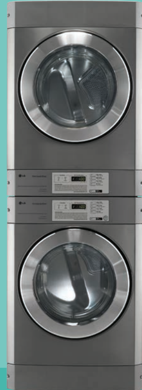
GD1329LGW2 – OPL Dryer (gas), Upper Stack GD1329LEW2 – OPL Dryer (electric), Upper Stack GD1329LGD2 – OPL Dryer (gas), Lower Stack GD1329LED2 – OPL Dryer (electric), Lower Stack